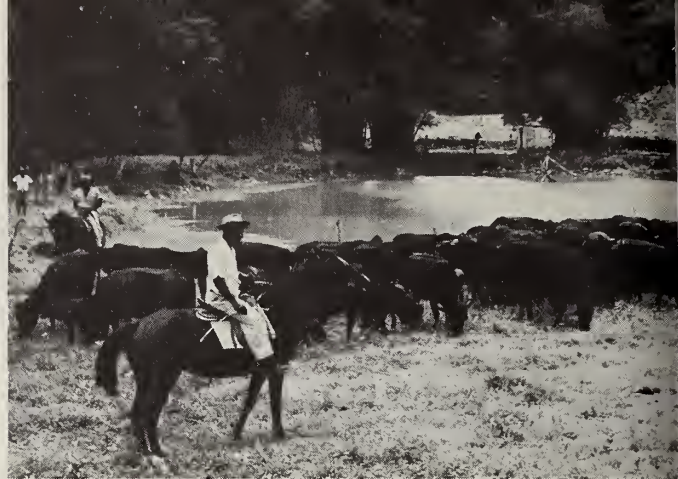
Above, cattle graze in Jamaica, which is trying to improve its meat and dairy industries; right, coconut palms yield copra, Tobago's chief crop.

Under present price conditions, the only U.S. dairy products with any possibility for sales in the Netherlands Antilles are dietetic and baby foods. Some possibility